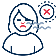
Loss of, or change in taste or smell